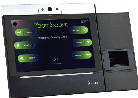
stride®80 with Fingerprint Reader

To learn more about stride®80 visit www.accu-time.com or call -1 860.870.5000