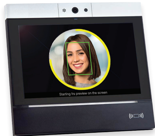
stride®80 with Facial Recognition / HID® ProxPoint® Badge Reader