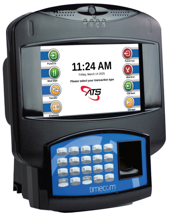
PeoplePoint™ Time Clock with Fingerprint Reader / ProxPoint® Badge Reader

More than just time clocks, Accu-Time Systems' TimeCom® is an advanced enterprise-grade timekeeping solution that integrates seamlessly with Oracle Cloud Time and Labor. It combines robust time clocks, sophisticated software, and cloud technology to deliver accurate and efficient employee time management. TimeCom® streamlines workforce data collection and processing, typically implementing within six weeks to quickly enhance operational efficiency for businesses.